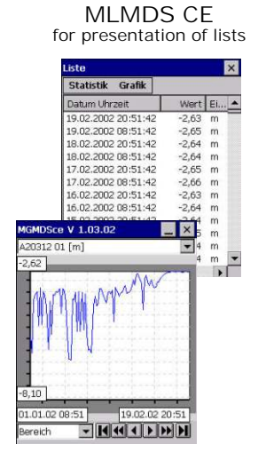
MGMDS CE for presentation of graphs