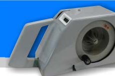
Depth Indicator type TLG

The SEBA-Depth Indicator Type TLG has been developed as a portable unit for rapide and accurate observation of bore hole water levels. It also can be used for measurements in the open sea or for measurements of the cross section of a lake. Operated manually by holding above the bore hole it provides a clear, instantaneous indication on a five figure counter calibrated in metres and centimetres and is rapidly rewound.