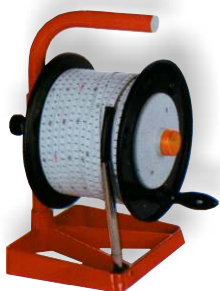
Contact Meter KLL

The SEBA-Electric Contact Meter type KLL is a portable, reliable instrument for measuring the water level and total depth in boreholes, wells, reservoirs etc. For the measurement the bob is lowered to the water level. When touching the level, a sensor effects the illumination of a signal lamp. On request, an additional acoustic signal will be released by a buzzer. The depth is shown on the cable in metres and centimetres. If the measurement of water level and total depth is desired, an additional ground sensor (see accessories) is adaptable. When the sensor is touching the bottom, the signal lamp is switched off. In case of very small diameter tubes, instruments with a probe of 10 mm dia. (not suitable for ground-sensor and sensor-cap) are available.