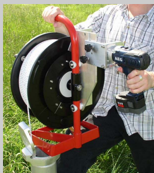
KLL with electrical drive