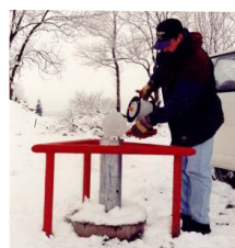
Water level measurement