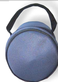
carrying bag for KLL-Mini

For convenient transport and safe storage a protection bag is available, made of textile with zip, carrying strap and belt loop.