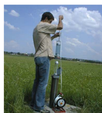
Ground water sampling