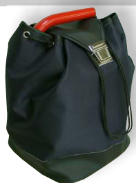
carrying bag for KLL-T