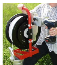
KLL with electrical drive