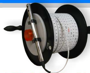
Contact Meter Typ KLL 15-50m with hand-drum

When the probe is touching the water-level there is a conductive connection between the tip of the probe and the sensor-body. Thereby a circuit of the lamp and the buzzer will be closed.